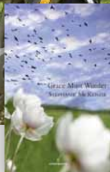
Grace Must Wander , 2009 978-1-907056-12-3