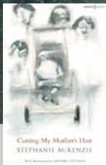
Cutting My Mother's Hair , 2006 978-1-903392-52-7